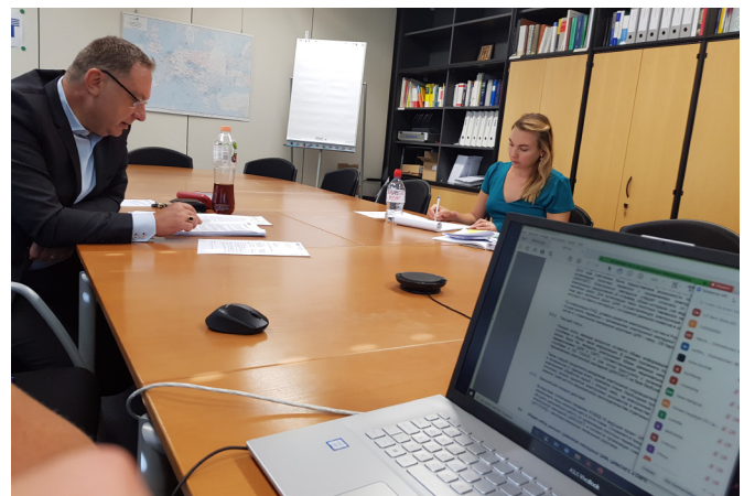
Virtual meetings of the expert and steering group