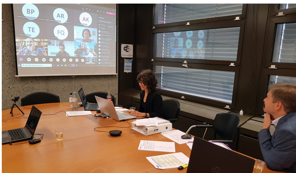
CIT/UIC Passenger Claims Department's Conference was held as on-line meeting