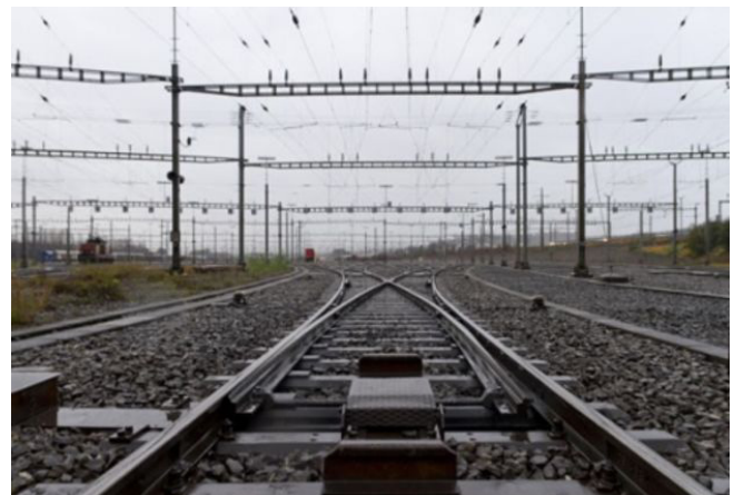
marshalling yard Lausanne-Denges