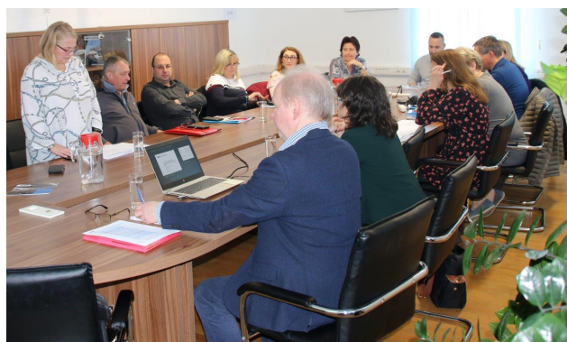
Very pleasant talks with Croatian Railways