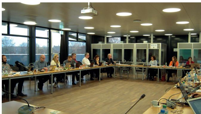
Ticketing and digitalisation: new technologies raise a host of legal questions

The CIV Working Group will thus closely monitor the rail projects seeking to apply these new technologies in order to deal with the fundamental issues they throw up and adapt, where necessary, the CIT products relating to ticketing and after-sales services.