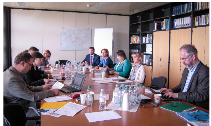
AG CIV/SMPS at work

The members continue to take an interest, in particular with regard to completing the revision of the PRR and exchanging personal data while respecting the GDPR. The CIT GS is interested in monitoring issues of data protection with third countries in rail passenger traffic between east and west, and in supporting internal data protection experts of the individual undertakings.