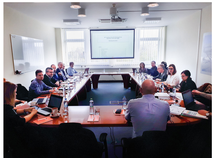
ZSSK hosted the 46th meeting of the CIV Working Group in Bratislava

The various proposed amendments and new CIT products were adopted at the CIV Committee meeting on 19 June 2019. They will enter into force on 15 December 2019.