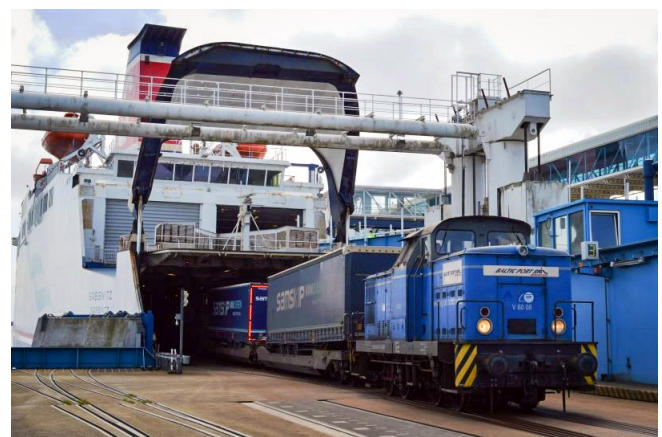
Discharging of a rail ferry of the "King's line"

The creation of a CIM/SMGS consignment note and related legal instruments, which overcome non-physical obstacles relatively quickly and cost-effectively, is a first step on the way to facilitating rail freight carriage in the areas of application of CIM and SMGS. However, customers are still calling for the speedy creation of a uniform law for CIM/SMGS traffic. The railway is the only mode of transport that does not have uniform legislation. The CIT considers its duty and mission to be fully involved in this matter.