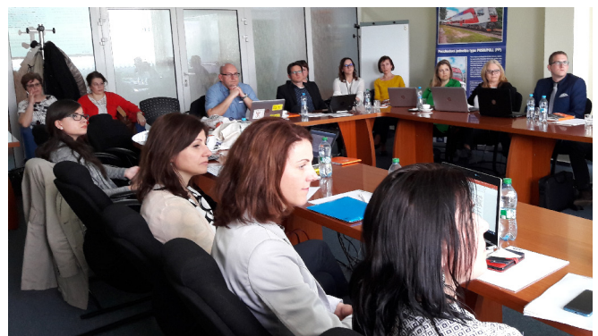
ZSSK staff attending the CIT training course in April.

The workshops are tailored to each undertaking based on their needs and the target audience. Undertakings who are interested in a training course should contact the CIT General Secretariat.